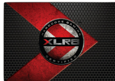
CS2211 Gamer/Enthusiast SSD